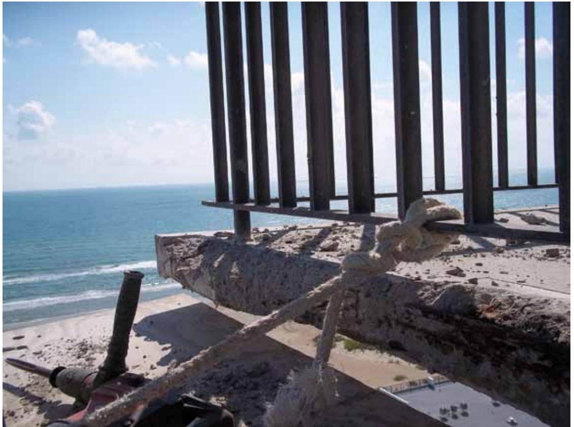
Concrete being removed from balconies

“Chloride ion testing was done to evaluate the current condition of the concrete in the structures. High chloride contents were discovered—not surprising in a coastal zone.”