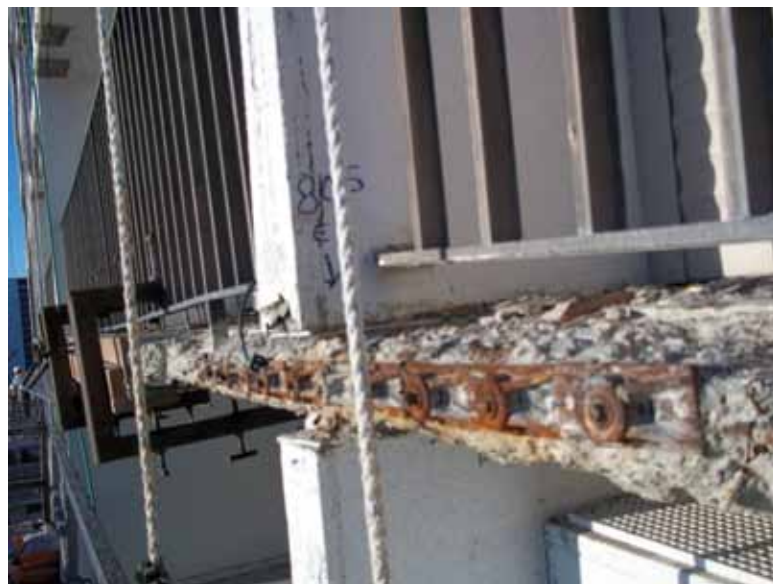
Corroded post-tensioned anchors

Work was conducted from 40 ft (12 m) swing stages. Because of the proximity to the Gulf,