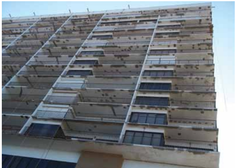
An extensive amount of concrete repairs were required for the balcony edges and soffits