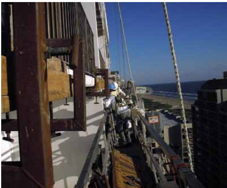
Repair work accomplished using swing stages

All of the exposed steel was treated with a corrosion inhibitor to protect the steel and also act as a bonding agent for the form-and-pour repair material. Anodes were used in strategic locations to provide additional cathodic protection in the high-chloride environment.