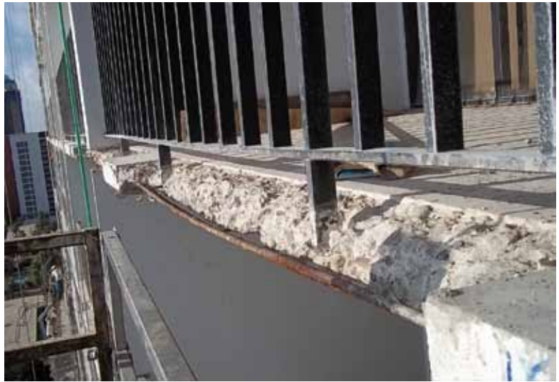
Balcony ready for repair material