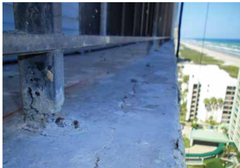
Deteriorated balcony slabs